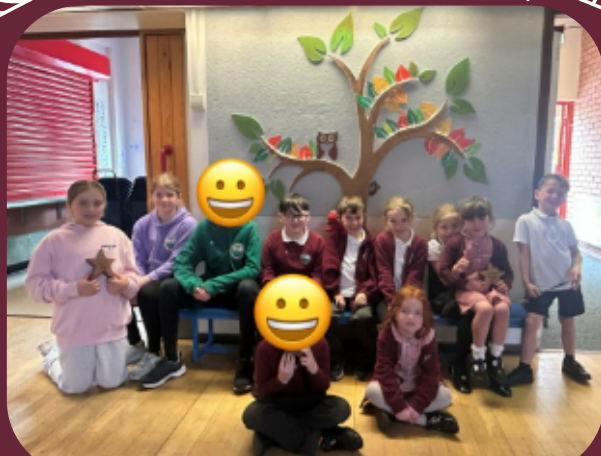
Congratulations to our Celebration Assembly winners this week!