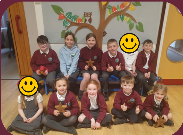
Congratulations to our Celebration Assembly winners this week!